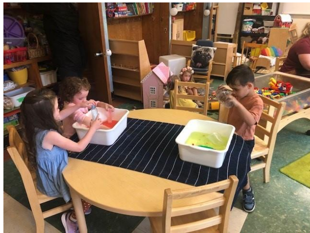
Pre-Primaries having fun exploring water-play.