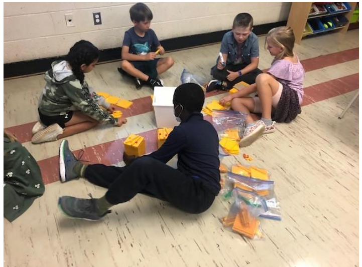
Learning math is always better when it's hands-on and we use games.